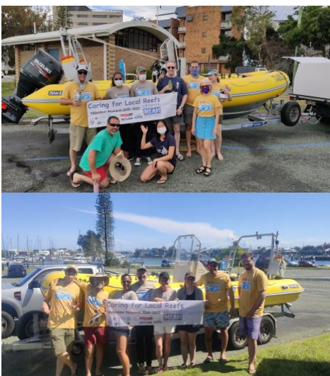
Survey divers completed surveys at the Inner & Outer Gneerings, Sunshine Coast.