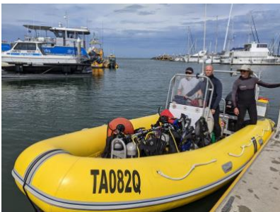
Scenes from the boathandler workshop.